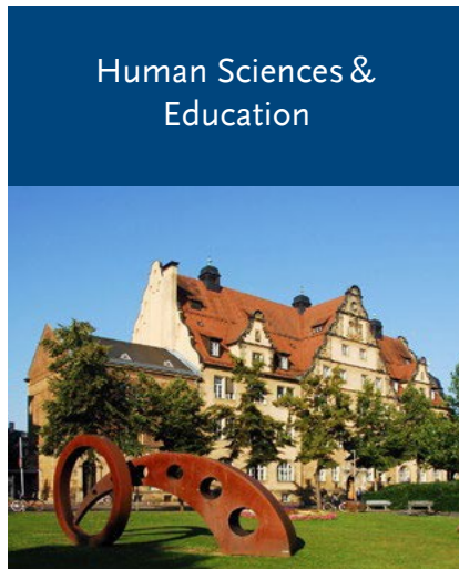
Human Sciences & Education