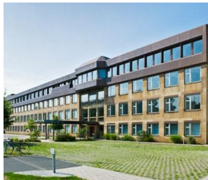
Social Sciences, Economics & Business Administration