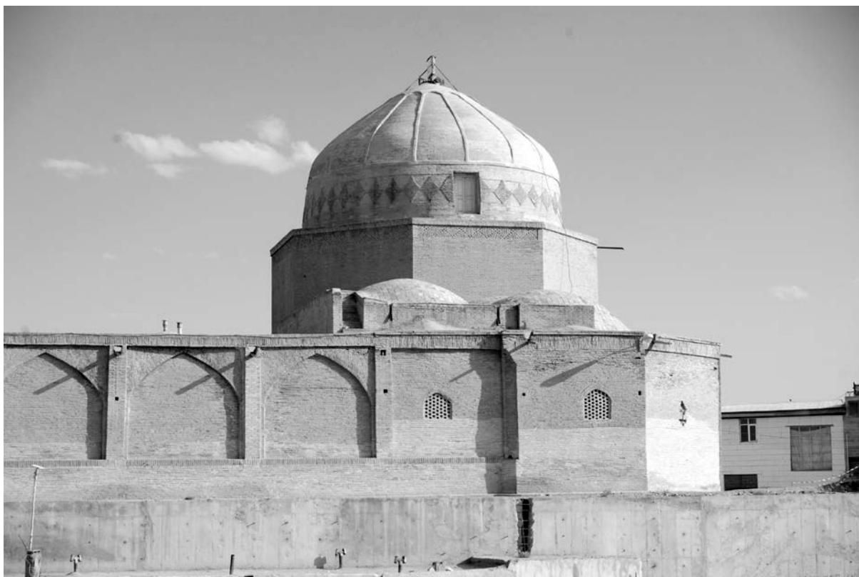
Golpayegan, Friday Mosque: View from NW

The major aim of archaeological excavation in the 2008 campaign was to gain more exact information on the pre-Saljuq buildings of which traces had been discovered in 2007. In particular, our intention was to find at least another pillar foundation of the kind which had been excavated in Area 1 during the first campaign, in order to determine the width of bays in the pre-Saljuq hypostyle mosque. If possible, the outer walls of the pre-Saljuq construction should also be detected. Besides, the unsolved question of the dating of the “iwan” had to be tackled.