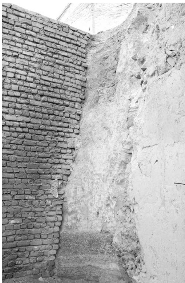
Golpayegan: Edge of Friday Mosque hill after cleaning

profile made it clear that the mosque hill is largely of natural origin and that only the topmost layer of c. 100-150 cm can be considered cultural debris.