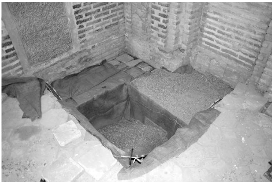
Golpayegan, Friday Mosque: Filling of trenches after documentation

Cooperation with the Iranian institutions was generally smooth. The district president ( farmandar ) of Golpayegan and the preacher showed interest in the findings and visited the site twice; they paid particular attention to the deep well which was found in Area 7 and which had stimulated the imagination of many onlookers. A regional TV station conducted extensive interviews with Iranian and German team members.