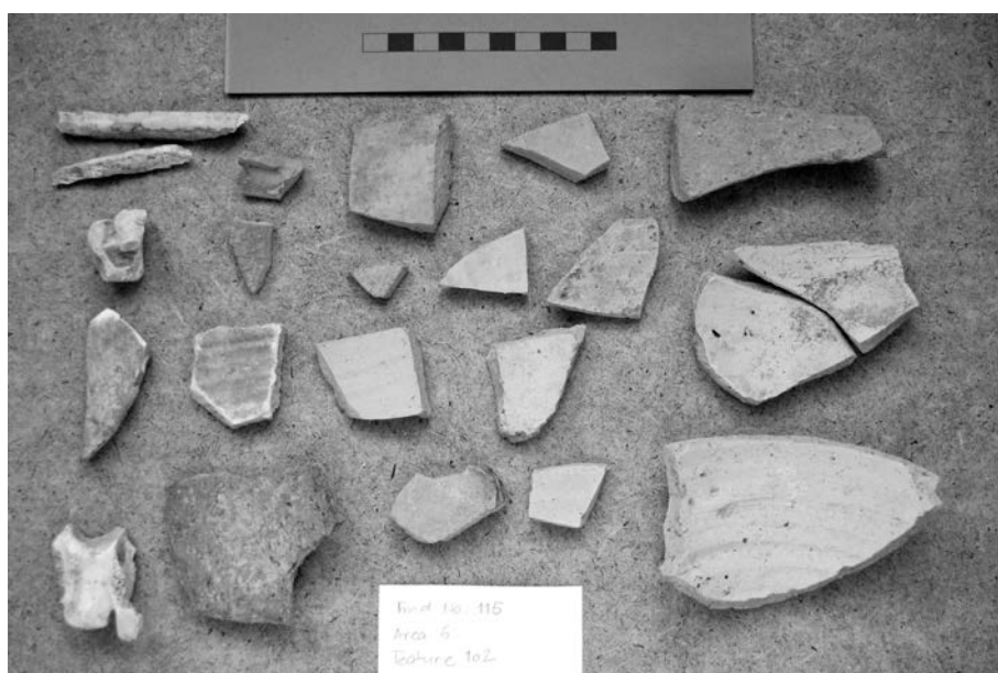
Golpayegan: Typical ceramic collection from lower stratum, containing few glazed sherds (upper left)