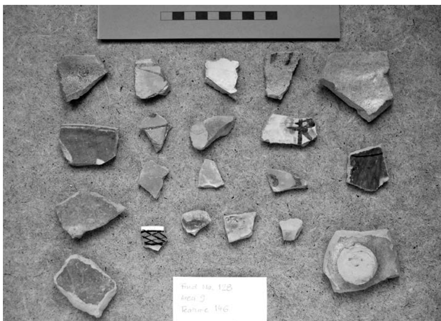
Golpayegan: Typical ceramic collection from upper stratum, consisting mostly of glazed sherds