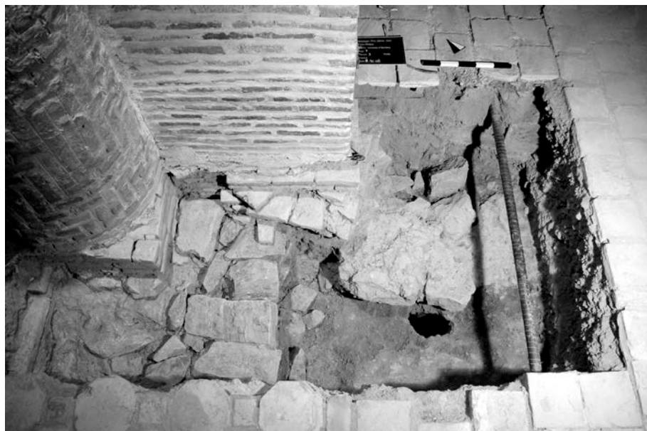
Golpayegan, Friday Mosque: Area 7, from SW. Note the opening of the well in the lower right area

wellhead to the water surface, it can be supposed that the newly discovered well is plugged with c. 4-5 m of fallen earth.