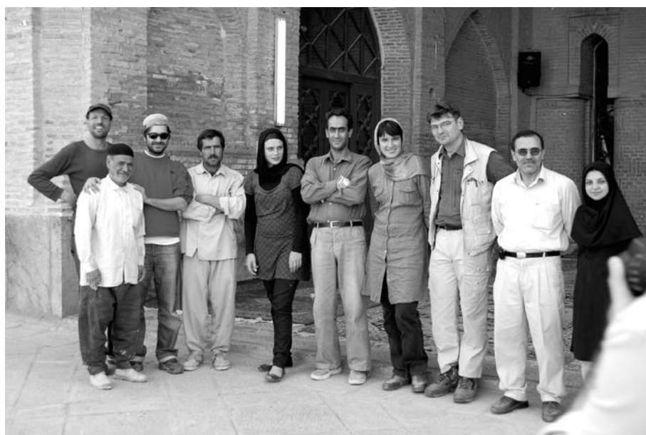
Golpayegan: Iranian-German team

Two workers from Golpayegan were employed permanently in the excavation.