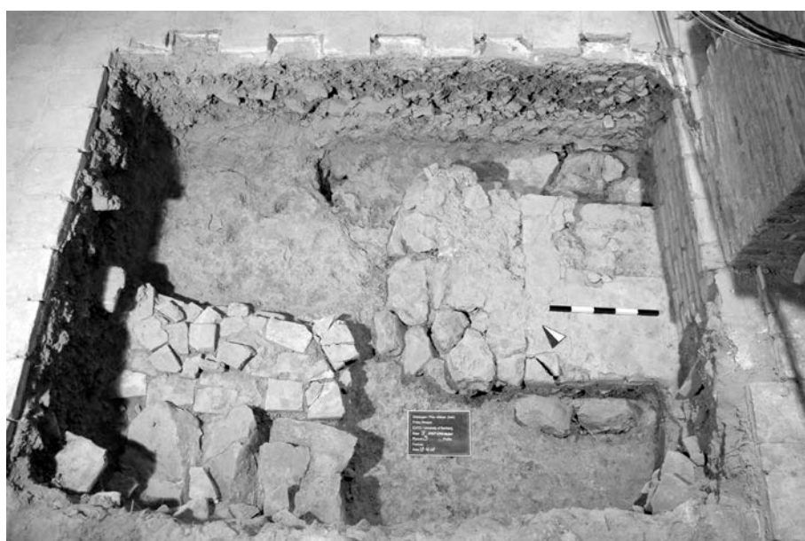
Golpayegan, Friday Mosque: Area 9, from SW. The measure stick lies on top of the pillar foundation

Next to the outer wall of the Qajar period south-eastern shabestan, Area 9 was excavated in order to uncover another pillar foundation of the pre-Saljuq mosque. The foundation was unearthed in a depth of c. 55 cm below present surface level. Quite similar to the foundation discovered in 2007 under the floor of the dome chamber (Area 1), it consisted of one layer of roughly dressed stones with two layers of bricks on top. Its size of nearly one meter square fits the dimensions of the columns which could be reconstructed from the wedge-shaped bricks (see above). Adjacent to the pillar foundation and on a slightly lower level, other remnants of stone and brick were found which could be interpreted as foundations. However, their irregular shape and the small area uncovered prevented far-reaching conclusions. The position of the pre-Saljuq foundation matched the alignment of the foundation discovered in 2007 (Area 1) and that of the possible foundation in Area 7.