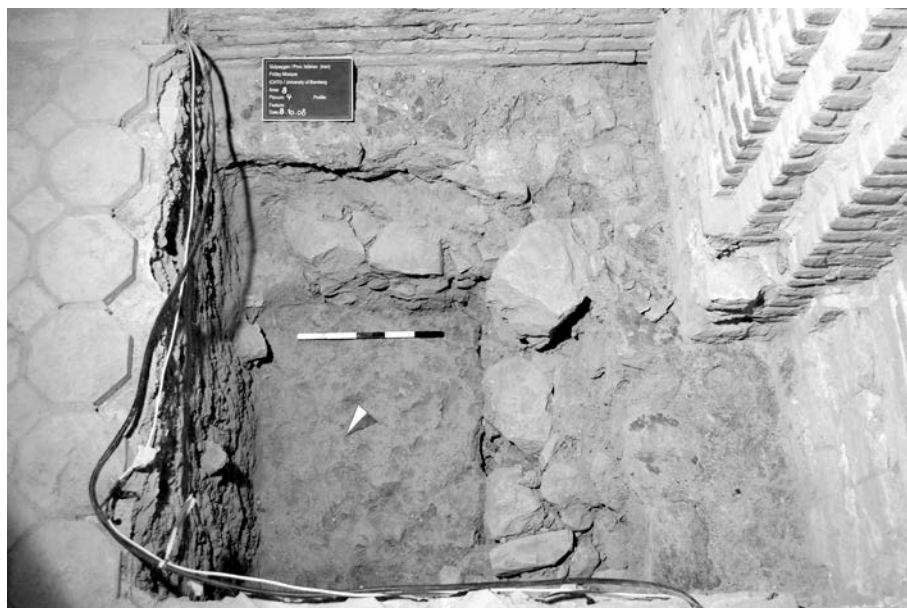
Golpayegan, Friday Mosque, Area 8, from NW