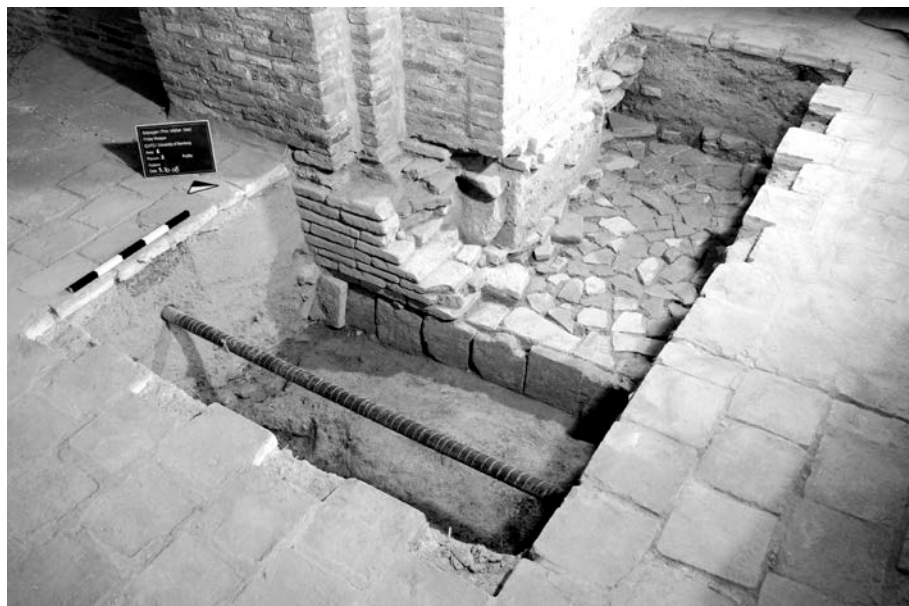
Golpayegan, Friday Mosque: Area 6, from E