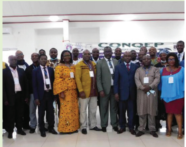
Five IMPEQ graduates in Cameroon engaged more than six hundred school heads for contribution to the quality of Protestant education.

While these ecclesiastical institutions have the manpower to deliver the goods of education, the question of quality is now reflected, and this is where IMPEQ experiences come in. The laureates of IMPEQ have supported UEC in its CONQEP project to have a scientific reflection on data collected for protestant schools in Cameroon. Still, within the framework of CONQEP, the UNESCO framework of understanding quality is primordial as it gives a road map to reflect the quality of education within the context of Cameroon. To this, IMPEQ Alumni from different parts of the country have been supporting school leaders to understand