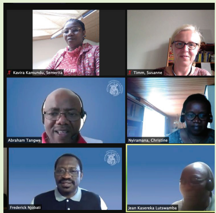
Project executives from Germany, Rwanda, Cameroon and Democratic Republic of Congo met for future cooperation.