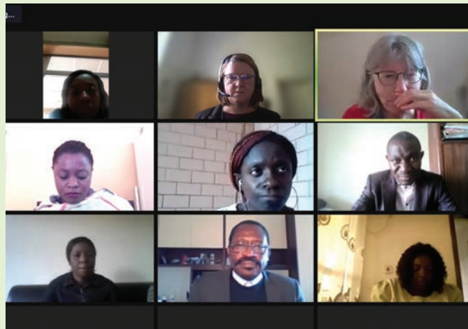
Because of Corona restrictions, the 5th cohort of the IMPEQ students could be able to travel to Germany. The first meeting and the teachings were held through online mediums with the attendance of students.

They will ponder over questions of classroom discipline, communication, learner-centered strategies,