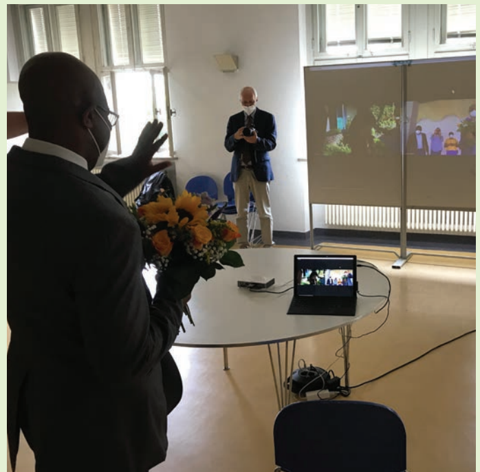
Abraham's family living in Cameroon followed the celebration through online because they couldn't travel due to the Corona restrictions.

males suffered from sexual abuse at the same levels as their female colleagues.