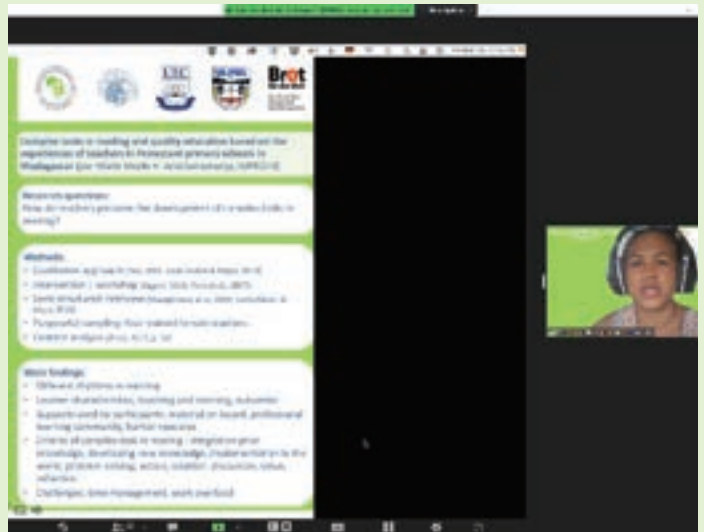
At the event IMPEQ graduates presented their books and answered the questions from the participants.