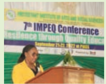
Dr. Valentine Uwamariya