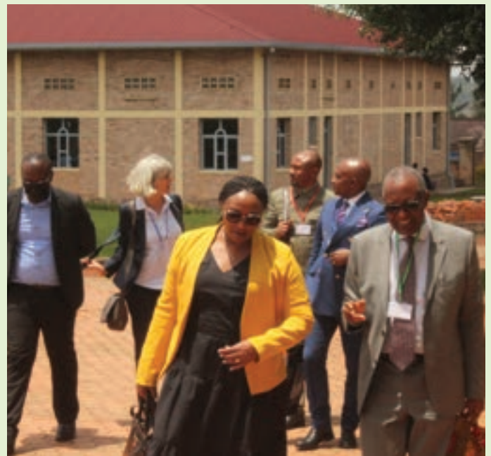
Participants continued discussing the issues even during the breaks.

The cultural evening was organized in order to create networks among the participants of the conference and learn how to talk and interact with people from different cultural backgrounds. Each represented country was asked to do performance on their cultural activities (dances, songs, poems, rituals or any other thing) that may show the culture from their respective countries. In addition, this cultural exchange was an opportunity to help individuals to adjust and learn about new environments and admire their differences while embracing their similarities.