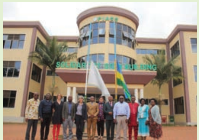
PIASS campus in Huye was the host of the conference.