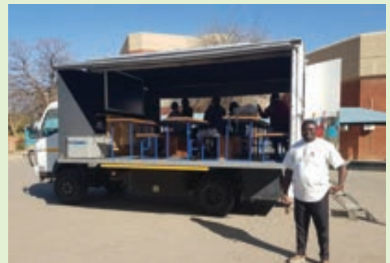
Mobile service of the ISTP Early Childhood Center, Bamenda Cameroon (L). Omombo-Mobile learning Classroom (R).

T he Environmental Education Association of Southern Africa (EESA) organized a four days conference from 23rd to 26th of August 2022 bringing together stakeholders in the field of education and environmental conservation on “Education for a post-Covid-19 recovery and attaining the SDGs: Reconsiderations, challenges, and opportunities”. Meeting in Windhoek, at the University of Namibia, different stakeholders from southern Africa reflected on thematic areas covering, climate conservation, food sovereignty, “Afrophilism” and conservation as well as aspects of educational quality.