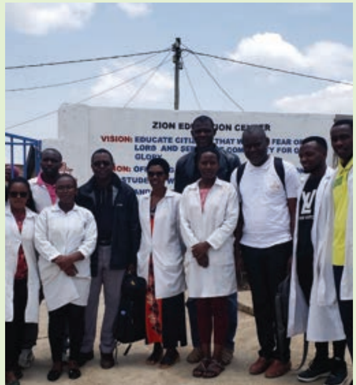
IMPEQ V from Cameroon students visited a school in Muhanga, Rwanda .

Pupils were intrigued by the idea and started exchanging letters because they were keen to learn about each other, their different learning environments and their countries. Videos and pictures of school activities were also exchanged. The morning assembly of pupils of Muhanga in the form of a circle inspired Alfred Saker CEPEC/EEC Bilingual Primary School to replace the frontal pattern with a circular pattern, which is friendlier and promotes a good school climate. The Anglican Zion Primary School in Muhanga was also impressed by the Douala pupils'